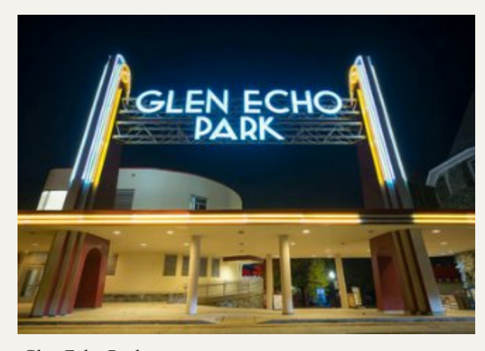
Glen Echo Park