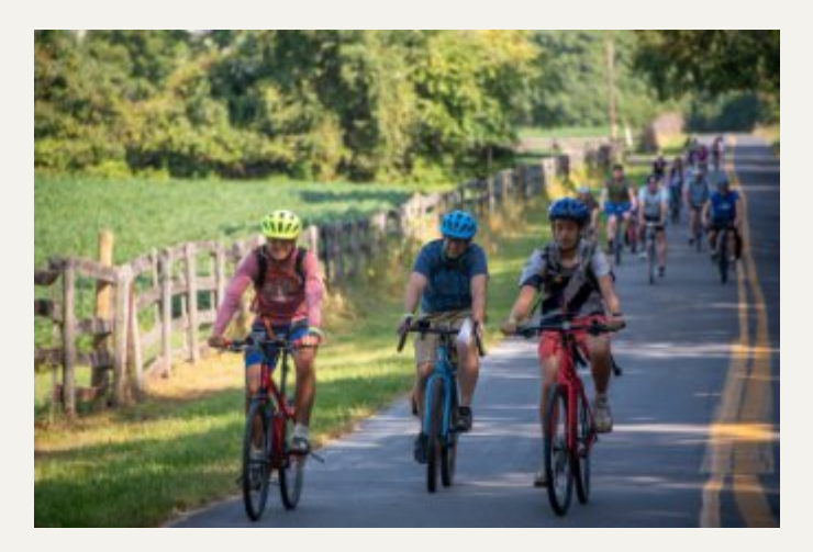
Countryside Alliance Ride the Reserve