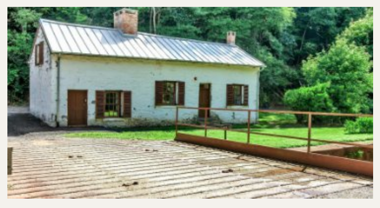
Canal Quarters Swain's Lockhouse