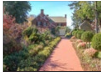
WOODLAWN MANOR CULTURAL PARK OFFERED VISITORS BEAUTIFUL GROUNDS AND HISTORIC STRUCTURES

hands-on, old-time learning activities at the historic Negro School.