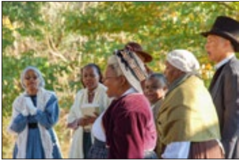
WASHINGTON REVELS JUBILEE SINGERS CELEBRATE EMANCIPATION DAY