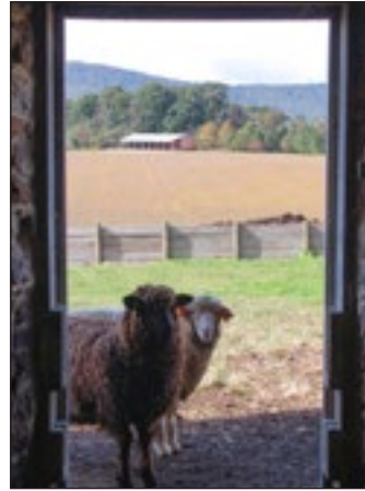
VISITORS TO SHEPHERD'S HEY ENJOYED THE SHEEP FARM AND ENDLESS VIEWS OF THE AGRICULTURAL RESERVE

lunch for purchase, and a pop-up holiday gift shop showcasing the work of county artisans. At Linden Farm, the Montgomery County Planning Department's Historic Preservation staff offered a fascinating tour of an exceptional Rustic Road and the workings of a historic dairy barn located deep in the Agricultural Reserve.