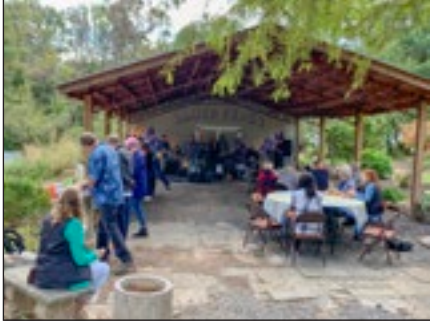
LIVE REGGAE MUSIC ENERGIZED THE LUNCH-TIME CROWD AT ALDEN FARMS

In Early October, local residents and visitors traveled along the county's Rustic Roads and enjoyed free admission to area farms, vineyards, and art studios, and took advantage of the opportunity to purchase locally