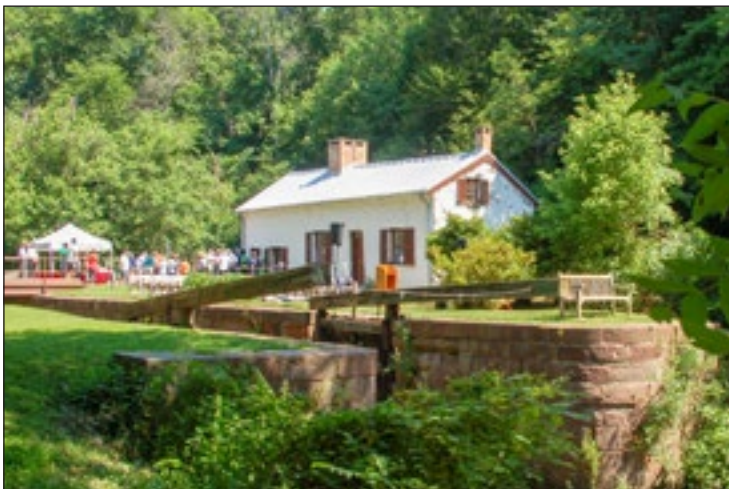
SWAIN’S LOCKHOUSE HOSTS CANAL CLASSROOM INTERPRETIVE PROGRAMS THAT ALLOW VISITORS TO STEP BACK IN TIME AND EXPERIENCE LIFE ALONG THE CANAL