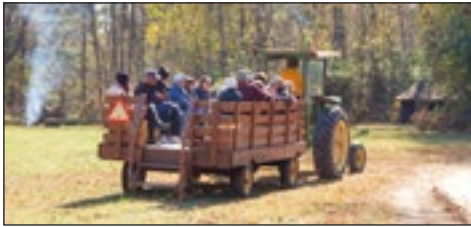
A HAYRIDE TAKES VISITORS TO THE HISTORIC CEMETERY

Later in the day, Washington Revels Jubilee Voices gave a concert of traditional African American songs from the county and told stories of escape and freedom. There was a sing-along for the crowd which was met with enthusiasm. This performance was made possible by Heritage Montgomery Mini Grants for research and development of the program, which will be performed at other county locations in the coming months. When details about these performances become available, they will be announced on the HM website.