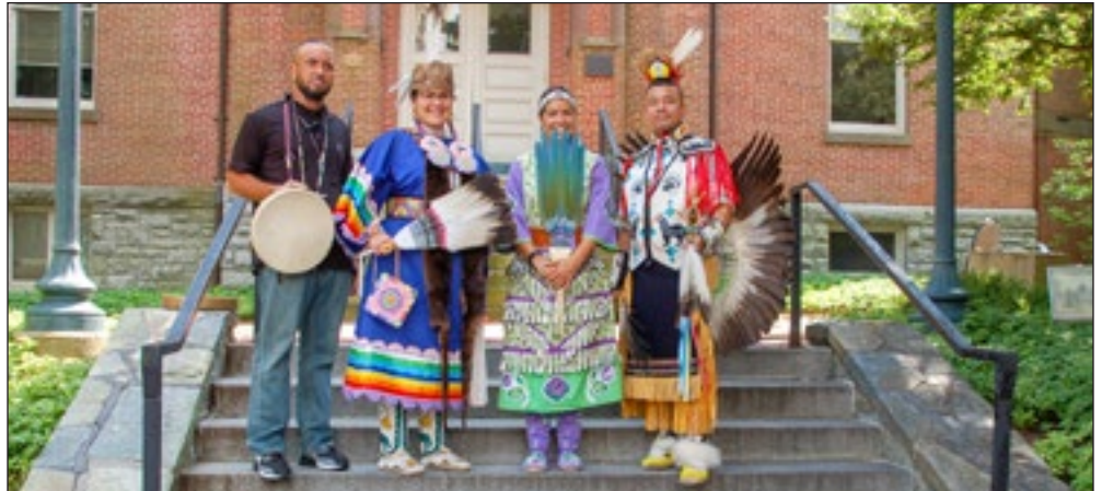
NATIVE AMERICAN DANCERS AND DRUMMERS TAKE CENTER STAGE AT ROCKVILLE'S COURTHOUSE SQUARE DURING HERITAGE DAYS 2019