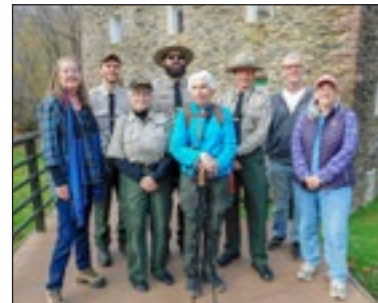
DEDICATION CEREMONY AT BLACK ROCK MILL.

On Thursday, November 8th, new interpretive panels were dedicated at Seneca Creek State Park's Black Rock Mill in Germantown. Located along the banks of Great Seneca Creek, the remains of this 1815 grain-grinding