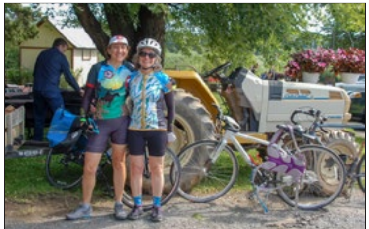
CYCLISTS AT THE 2018 RIDE FOR THE RESERVE.