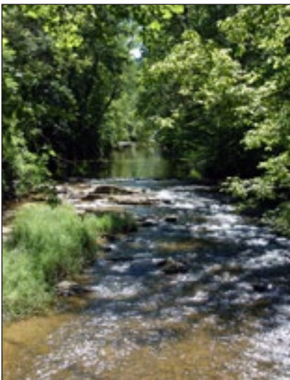
SENECA CREEK STATE PARK

In June, HM submitted a proposal to the Maryland Heritage Areas Authority (MHAA) amending the heritage area’s boundaries. This amendment addressed the fact that a number of important sites thematically and physically linked to Heritage Montgomery had been omitted from the 2002 Management Plan and were therefore ineligible to apply for MHAA capital and project grants. The first of these omissions was remedied in 2013 when HM’s boundaries were amended to include Rockville and its heritage assets.