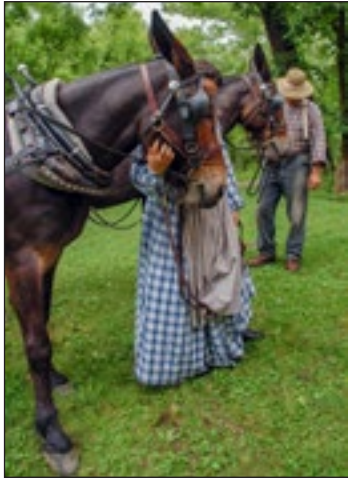
CANAL MULES AND SKINNERS AT EDWARD'S FERRY.

We were delighted to see great turnouts for Heritage Days events at sites all across the county. The incredibly wide variety of programs and activities offered this year guaranteed that there really was something for everyone!