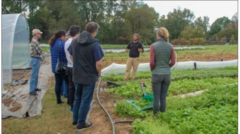
COMMON ROOT FARM TOUR IN DERWOOD.