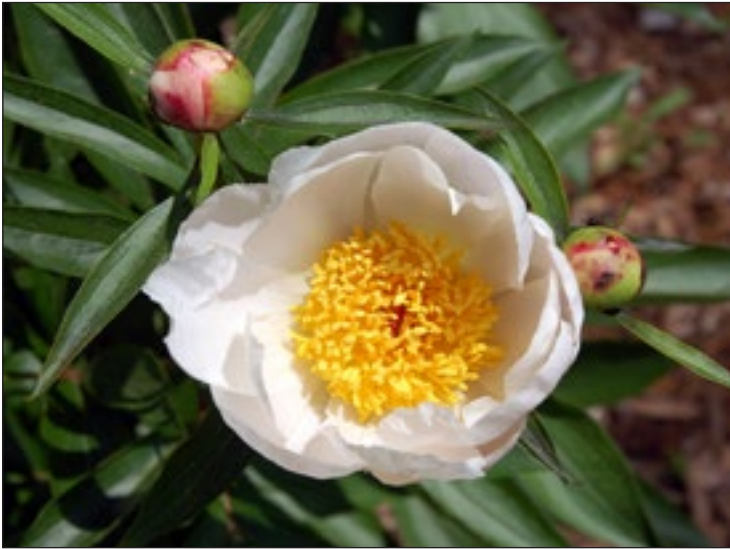
A SPRING BLOOM AT THE SCHWARTZ PEONY GARDEN IN SENECA CREEK STATE PARK.

As we approach year's end, we would like to ask that you remember Heritage Montgomery in your year-end giving. Because we are not a membership organization, our annual (and only) fundraising appeal is of critical importance and has a significant impact on HM's efforts to support and promote Montgomery County's unique history, culture, and nature.