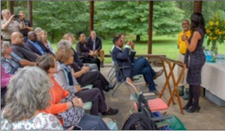
AWARD CEREMONY AT BUTTON FARM.

The Menare Foundation has been recognized with a Governor’s Proclamation for its work at Button Farm Living History Center promoting the Underground Railroad legacy through unique living history experiences.