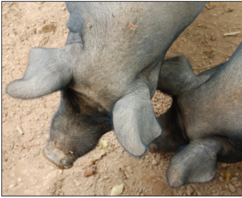
BUTTON FARM GUINEA HOGS