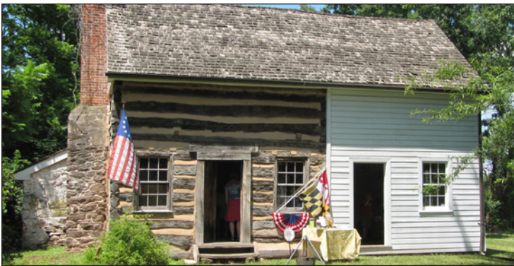
JOHN POOLE HOUSE

We were very pleased to submit eight strong grant applications to the Maryland Heritage Areas Authority in April. Grant awards will be announced by MHAA in June. We are already working with several groups planning for FY 2019 grants. A large part of our work is helping sites to plan solid projects and produce winning grants! It's never too early to give us a call to discuss your next project.