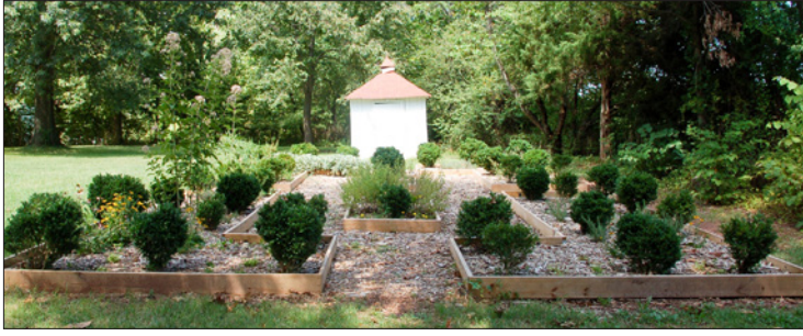
FY16 MINI-GRANT PROJECT: ARBORETUM AT JOHN POOLE HOUSE

As we approach year's end, we would like to ask that you remember Heritage Montgomery in your end-of-year giving. Because we are not a membership organization, our annual (and only) fundraising appeal is of critical importance. Your donation will contribute directly to outreach programs at HM, from Heritage Days to Mini Grants.