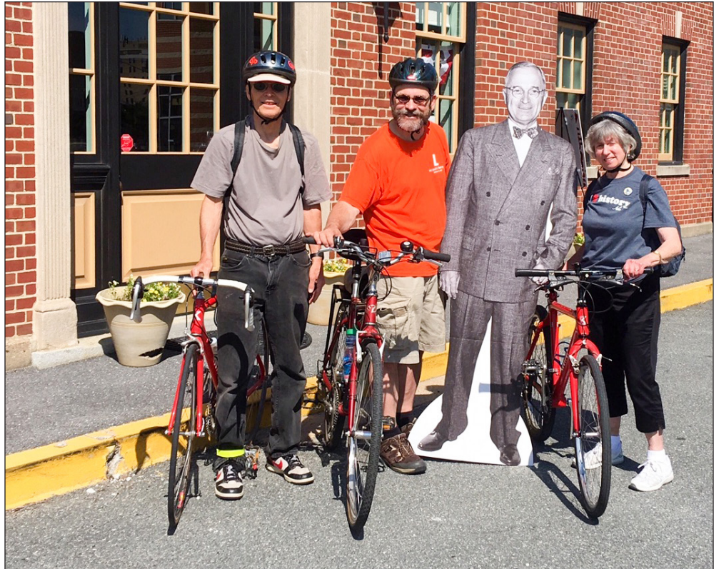
HERITAGE DAYS CYCLISTS, PHOTO COURTESY OF SILVER SPRING HISTORICAL SOCIETY