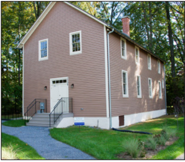
ODD FELLOWS LODGE