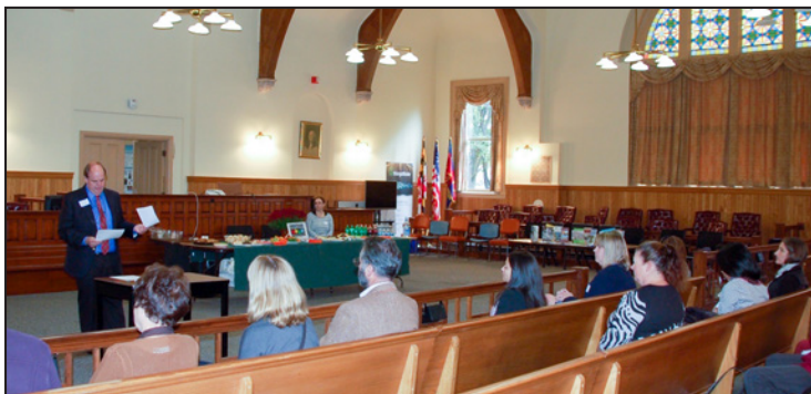
MINI-GRANT RECEPTION IN THE HISTORIC RED BRICK COURTHOUSE

$2500 – for the 3rd annual Field & Fiddle Festival