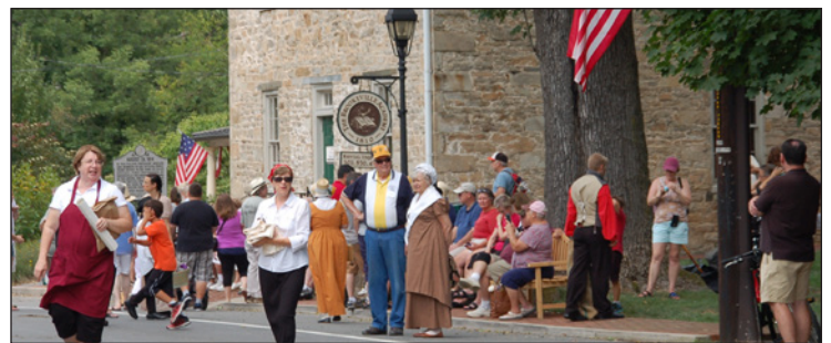
BROOKEVILLE STREET SCENE

Discussions are underway to develop a Brookeville Walking Tour linking the town's Quaker and African American history with nearby sites, including M-NCPPC parks and trails. A strong association between the historic locations in and around the town of Brookeville and Montgomery Parks' new Woodlawn Visitor Center will add depth to the rich Quaker and African American heritage stories in the Brookeville/Sandy Spring area and offer visitors an expanded means of exploring this aspect of local history.