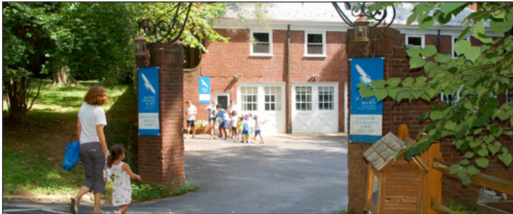
AUDUBON NATURALIST SOCIETY AT WOODEND

HM is pleased to be in talks with two well-respected organizations about becoming part of the heritage area.