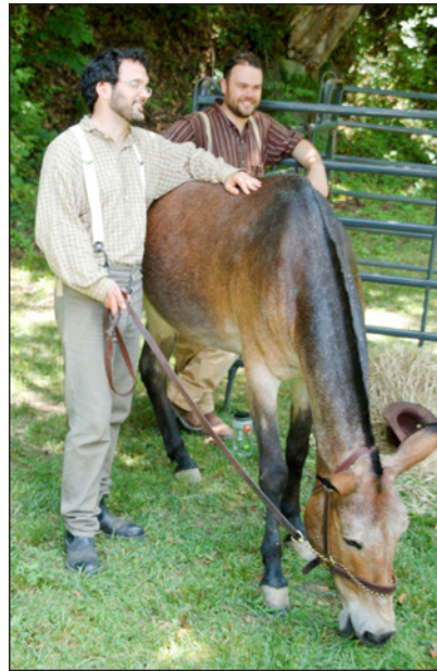
CANAL PONY MULE

walking tours of the Germantown Historic District, a railroad town dating to the 1880s. And it is always fun to check out all of the model trains and transportation exhibits at the historic Silver Spring B&O Railroad Station; this year a bike/picnic tour of historic Silver Spring that left from the station was a fun way to spend Sunday morning.