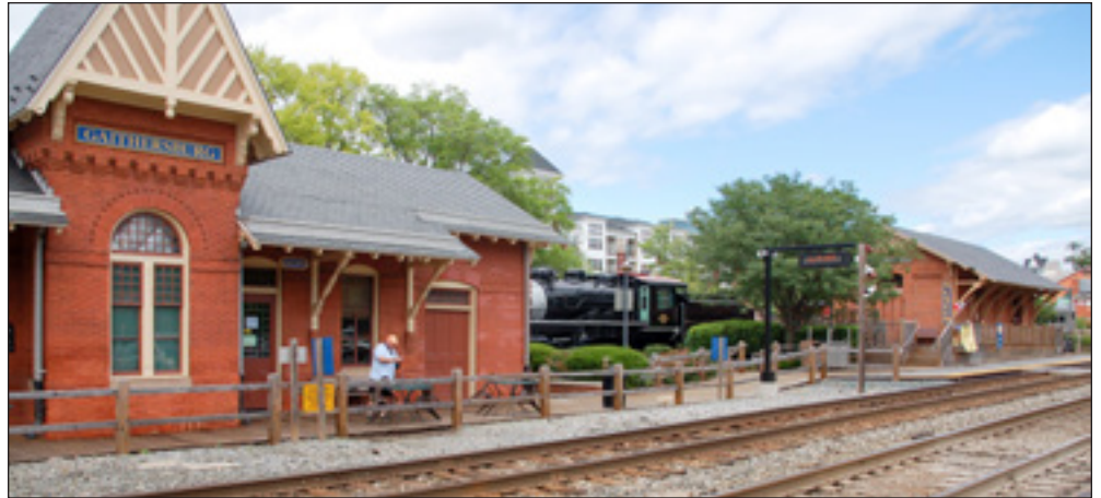
GAITHERSBURG COMMUNITY MUSEUM AND HISTORIC TRAIN STATION