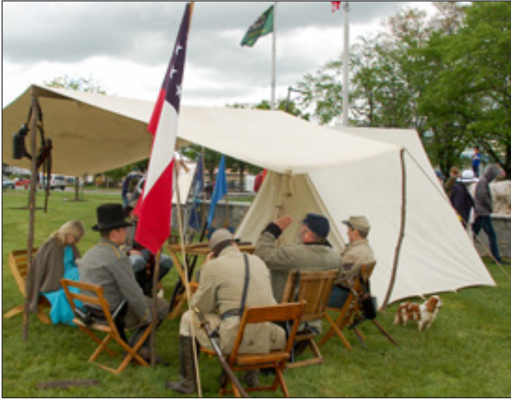
CIVIL WAR REENACTORS ON WHALEN COMMONS

Heritage Montgomery would like to thank all of our donors for their generous contributions to our efforts supporting and promoting the heritage area. Thanks to your donations, HM can help fund important local projects with Mini Grants as well as support wonderful community programs like Poolesville History Day, pictured below.