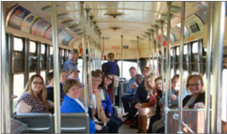
RIDING THE STREETCAR AT THE TROLLEY MUSEUM

Heritage Montgomery was pleased to host the spring meeting of the Maryland Heritage Areas Authority on April 14. After a morning of meetings at the Sandy Spring Museum, attendees grabbed boxed lunches and set off on a heritage area bus tour. First stop was the new Woodlawn Stone Barn Visitor Center, a project funded by MHAA capital grants. The visitor center, a Montgomery Parks site with a grand opening planned for June 11, will be the hub for exploring the agricultural, African American, and Quaker heritage of the Sandy Spring/Brookeville area. Next stop was the nearby Oakley Cabin African American Museum & Park, part of an African American tenant community dating to the 1800s. The day finished off with a trolley ride and behind-the-scenes tour of the National Capital Trolley Museum.