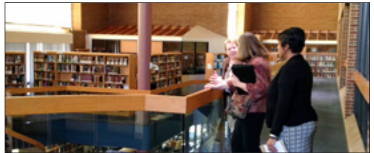
MARYLAND STATE ARCHIVES

Work continues on our project to protect the historic documents of local African American church communities. HM will partner with the Maryland State Archives (MSA) using their staff and equipment to help catalog, digitize, and stabilize records collected from the Pleasant View Historic Site. MSA staff will supervise our Montgomery College intern who will work at the Archives. The original records along with a digitized copy will be returned to Pleasant View, and MSA will retain a copy for their collection. Montgomery County Historic Preservation Grant funding has made this important project possible.