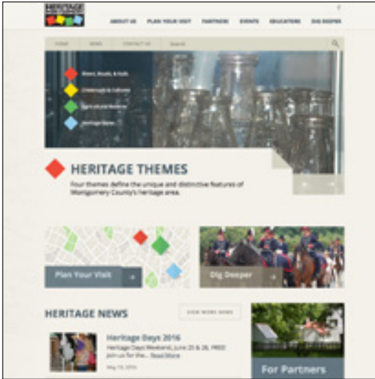
HOME PAGE SCREENSHOT

Heritage Montgomery is very pleased to announce the launch of our newly redesigned website! We hope it becomes an invaluable tool for anyone interested in learning more about the amazing history, culture, and natural areas of Montgomery County.